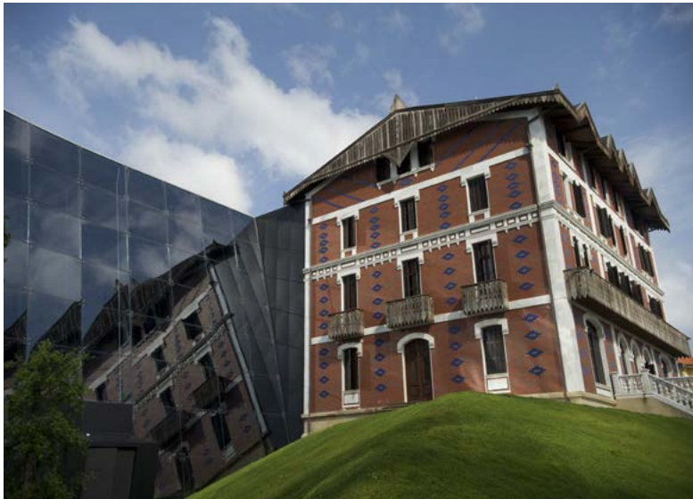
Exterior view of the Cristóbal Balenciaga Museum in Getaria.

The Cristóbal Balenciaga Museum, opened on 7 June 2011, is located in the town where the couturier was born, in commemoration of those early years of his professional training and maturing in order to understand his contributions to the world of fashion.