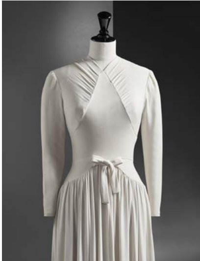
Wedding dress in ivory crêpe with tight-fitting body and sash that ends in a bow at the front. 1939. CBM 2012.06