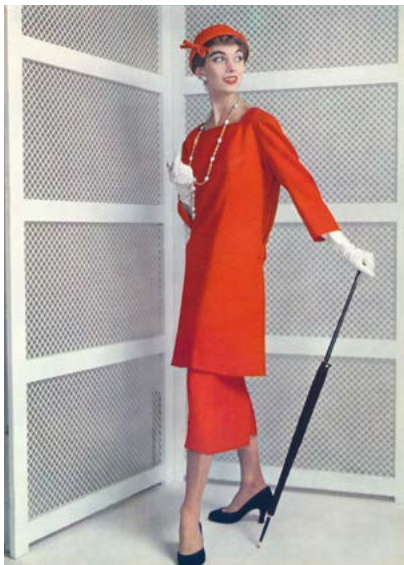
Two examples of the creative legacy of Cristóbal Balenciaga: “midi” and “tunic”.

materials, the new roles of women or the patriotic spirit mark a military-inspired fashion for a society committed to the war effort.