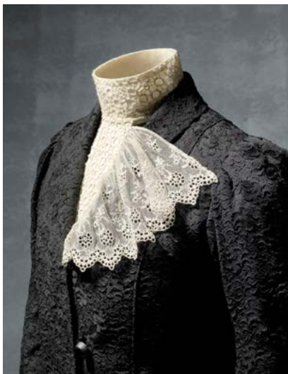
Tailored suit in black wool bengaline. 1912. CBM 1998.01

Balenciaga immediately impresses critics with his first collection in Paris, thanks to his technical command and proposals of Spanish flavour which set him apart from others. However, World War II breaks out immediately afterwards and for a number of years the scarcity of