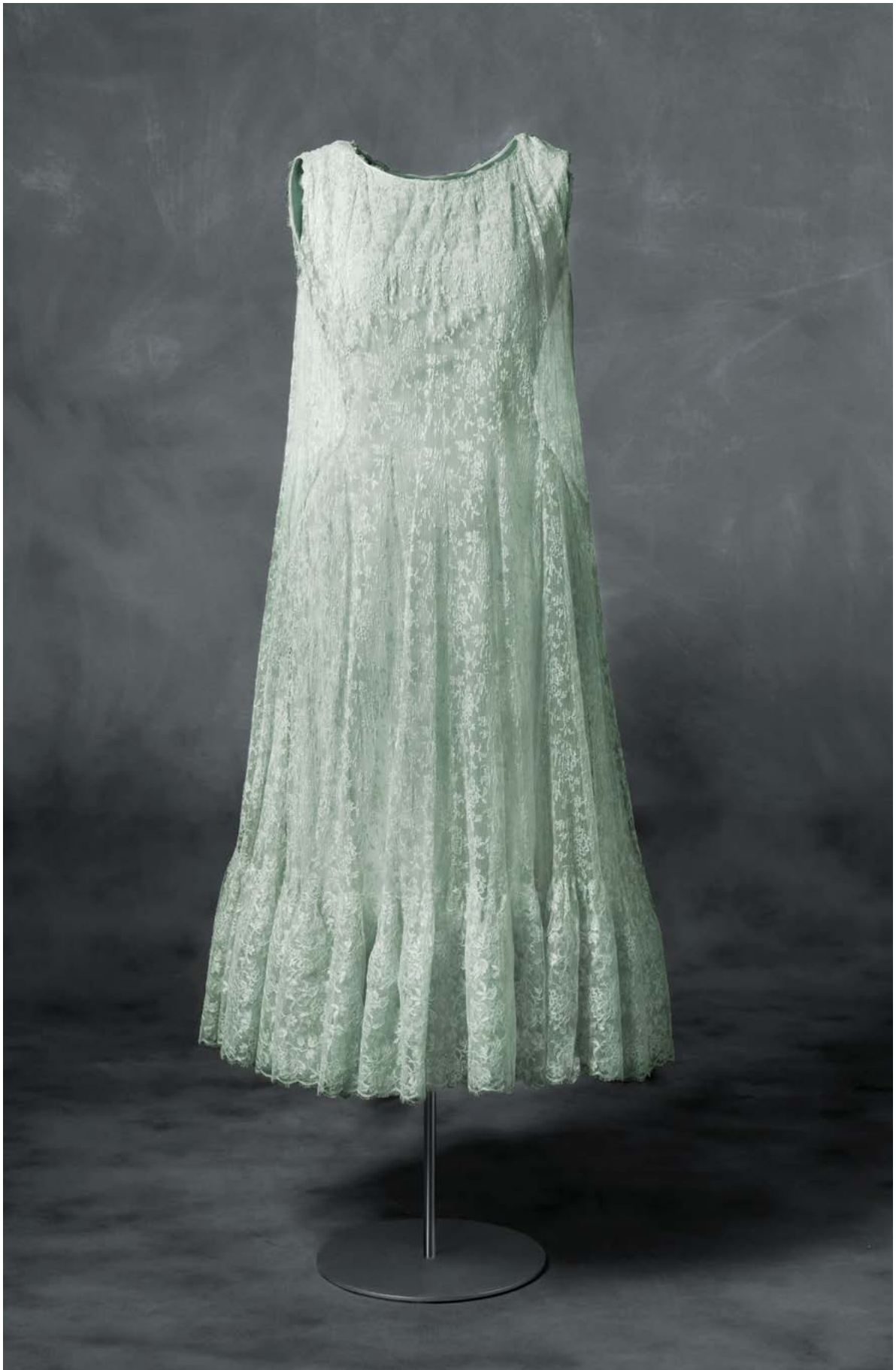
Cocktail dress in blue silk taffeta with lace transparency in blue silk. 1957. CBM 2000.51