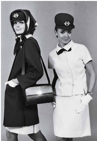
Uniforms for Air France hostesses, 1968.

In 1971, the Bellerive Museum in Zurich dedicated a first retrospective exhibition to Balenciaga, followed by many others that continue to this day.