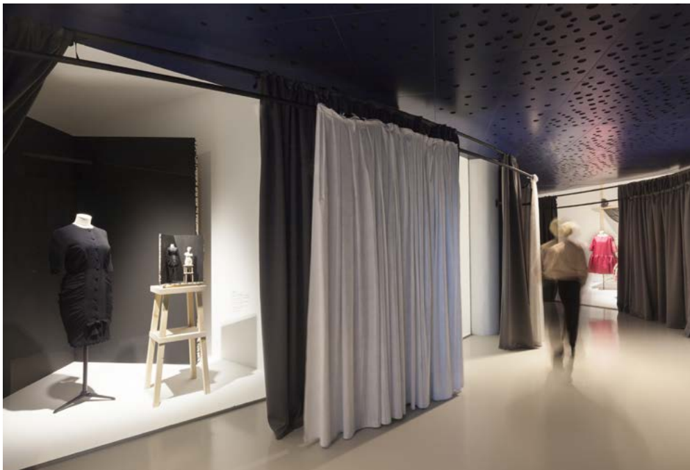
Cristóbal Balenciaga: Fashion and Heritage. © Cristóbal Balenciaga Museoa

Technology also plays an important role in this exhibition, facilitating interactivity through digitalisations that allow us to observe the detail (megapixel) of a piece, its 360° visualisation, infographics about its technical construction, and the app that allows to explore the contents in greater depth .