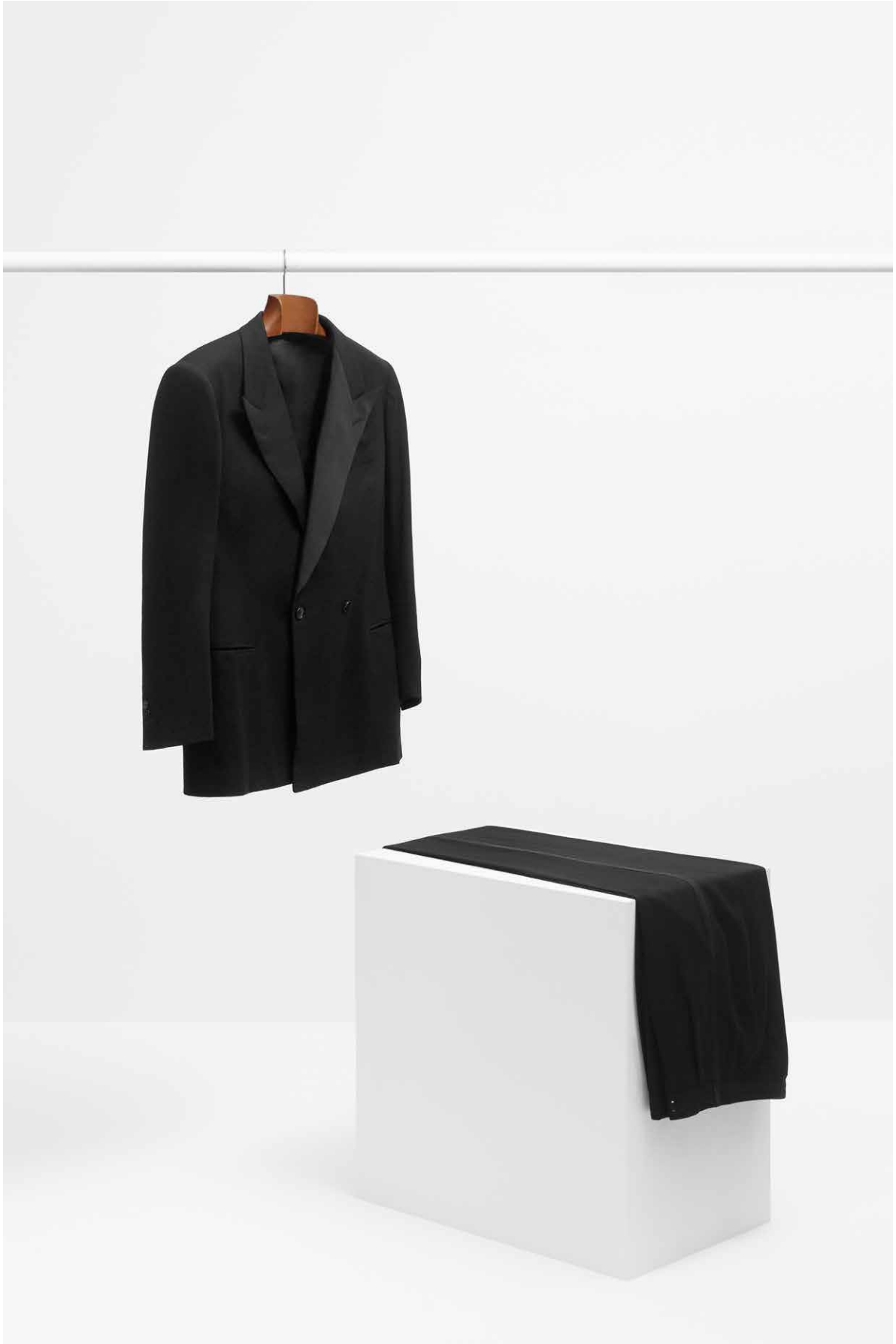
CBM 2000.128ab Dinner ensemble in navy blue wool Opelka, Paris, 1939