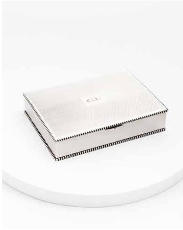
Silver box marked with the initials C.B.