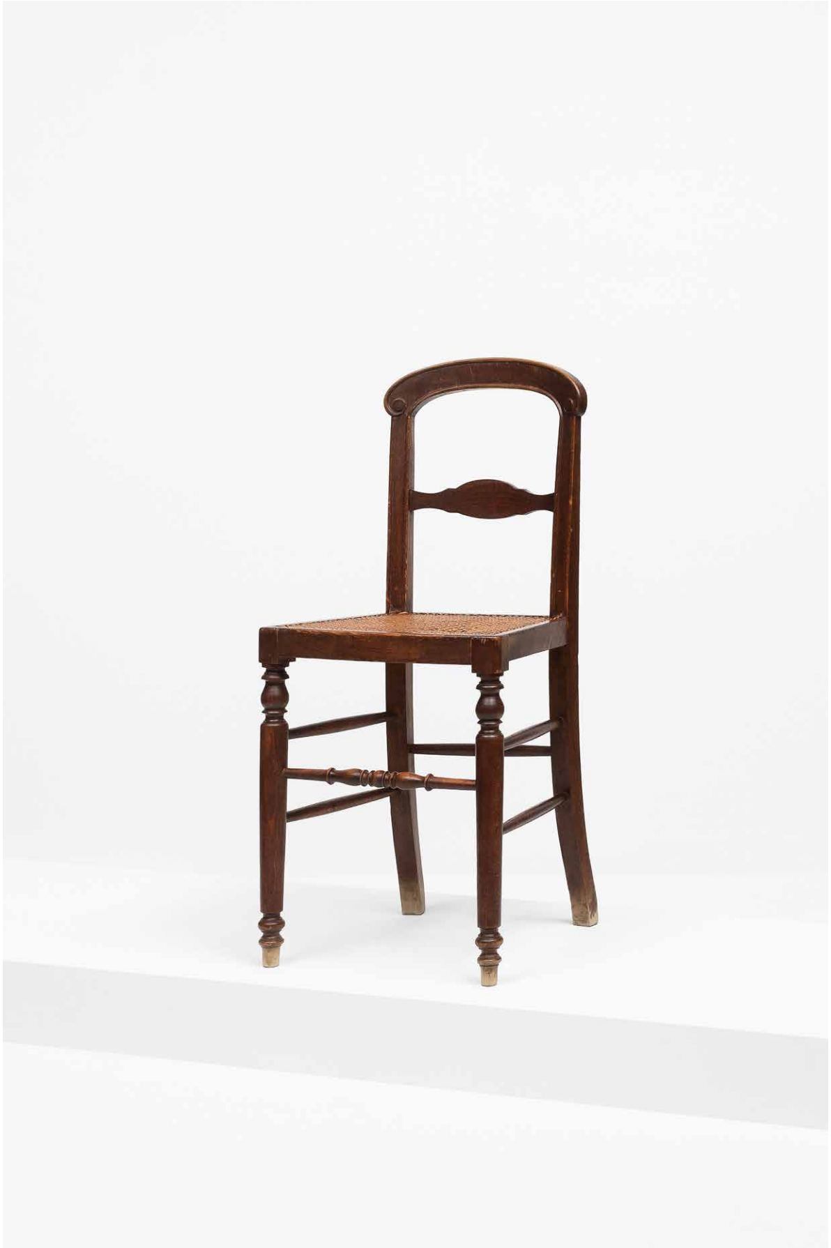
CBM 2000.228 Chair from the atelier at 10 Avenue Georges v in Paris