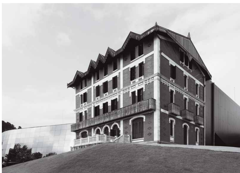
Exterior view of the Cristóbal Balenciaga Museum in Getaria

The Cristóbal Balenciaga Museum, inaugurated 7 June 2011, is located in Getraia, the designer's hometown and the stage for Cristóbal Balenciaga's first years of training and professional maturing. This is essential to understand his contributions to fashion.