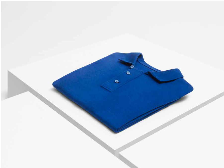
CBM 2000.93 Klein polo shirt in blue jersey that belonged to Cristóbal Balenciaga

The Museum's collections include Cristóbal Balenciaga's creations, but also the items that belonged to him and that help us to discover the different biographical, cultural and professional contexts Balenciaga lived in. Those nearest the designer (family, collaborators, workers, friends) preserved these items and have generously donated or loaned them to the Museum to be displayed.