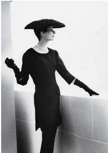
Two examples of the creative legacy of Cristóbal Balenciaga: "tunic" and "midi"

The exhibition's journey ends in 1968 when the maison closed, also referencing the later process of granting heritage status to his work while he was still alive and after the creator passed away.