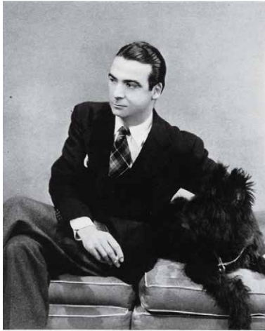
Cristóbal Balenciaga portrait by Man Ray