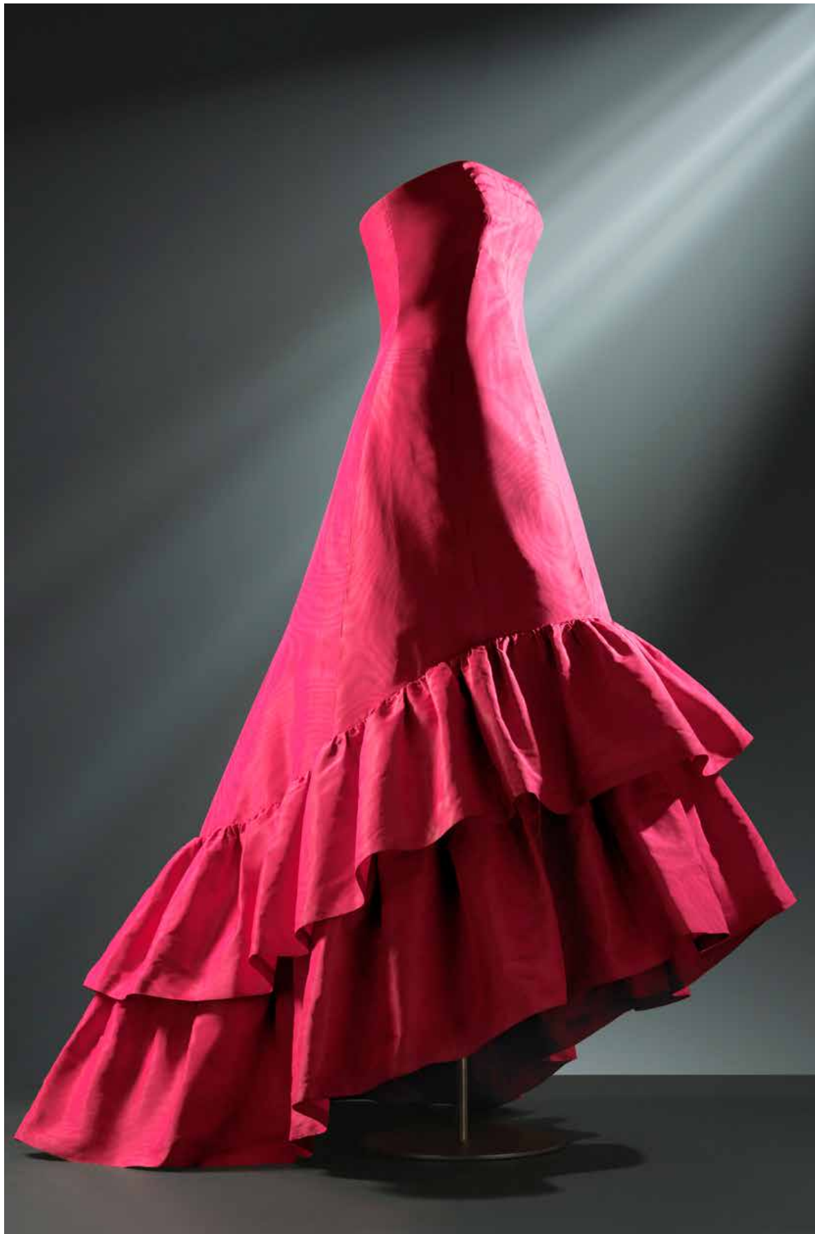
CBM 02.1999 Evening gown in fuchsia moiré taffeta with two ruffles.1963