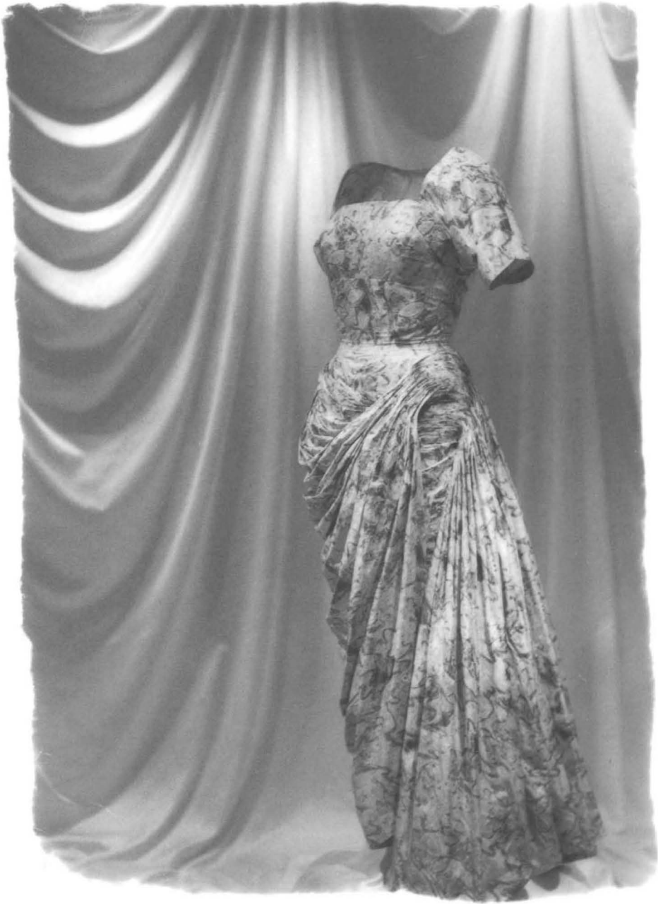
7. Evening gown and bolero jacket, 1956. Multicolored chiné silk taffeta by Bianchini. Gift of Lilly Daché, 1974 (1974.306.5a,b).