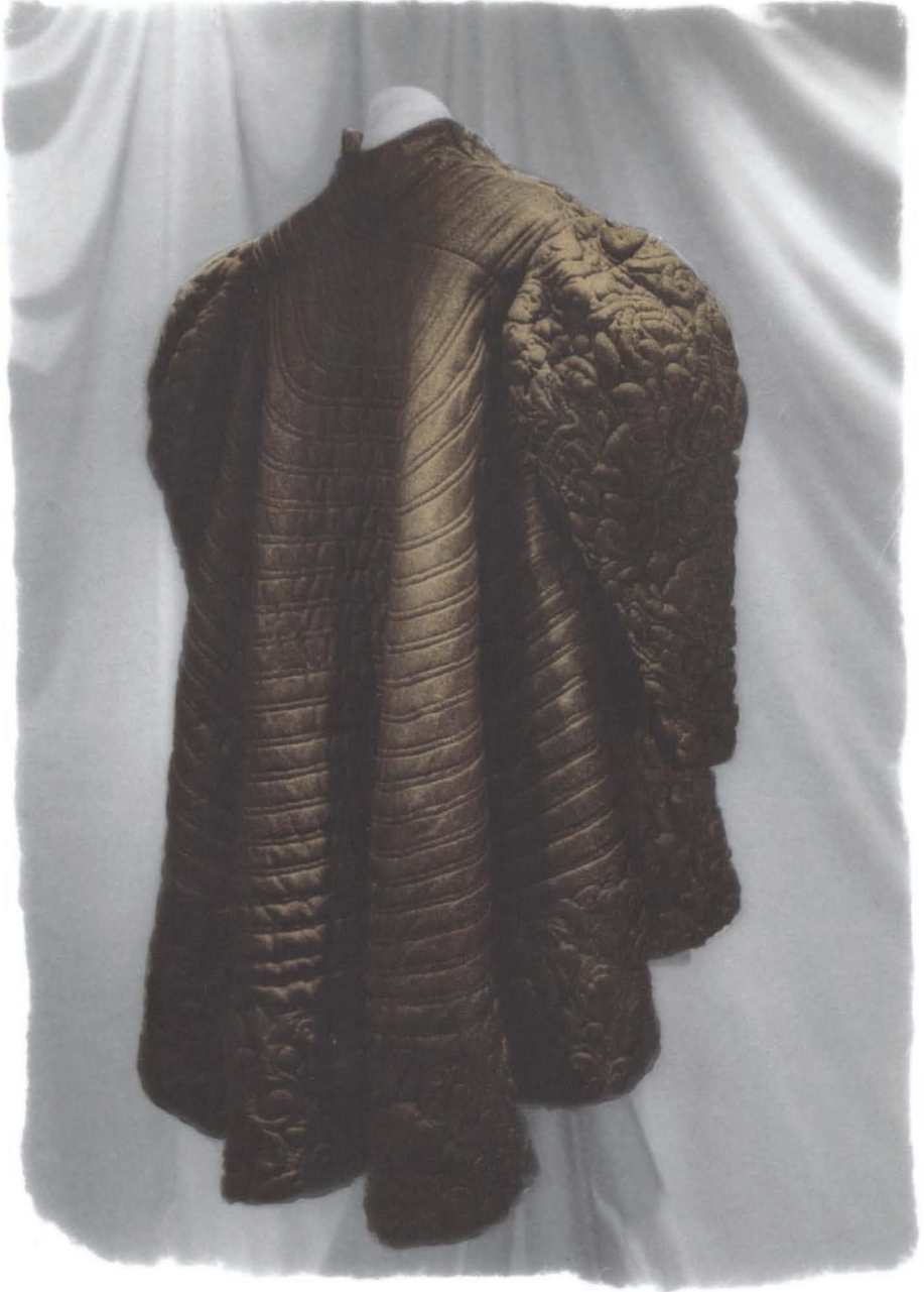
10. Evening coat, 1935. Gold-and-black lamé. Gift of Miss Ellerbe Wood, 1940 (CI 40.172).