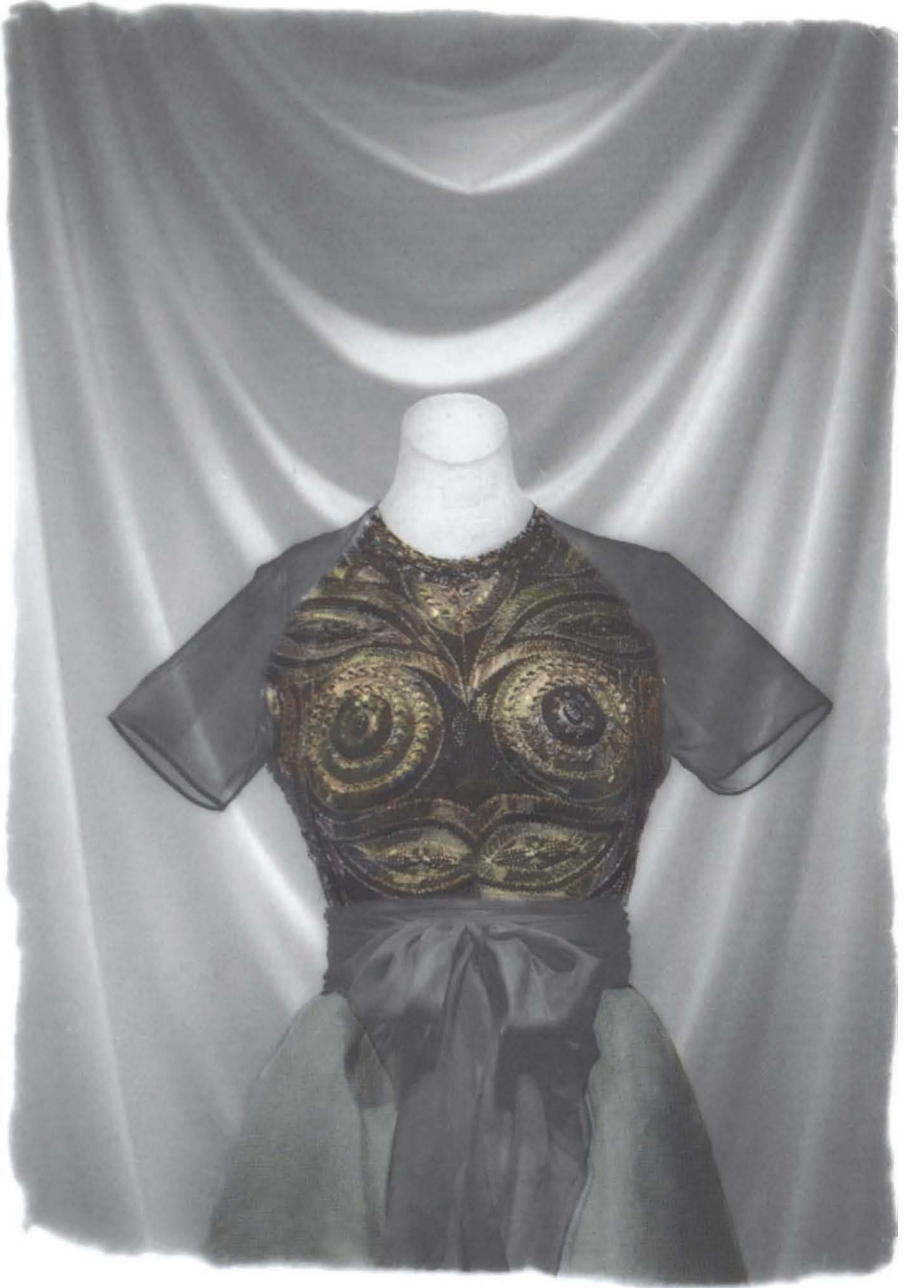
11. Evening ensemble, ca. 1970. Teal blue silk taffeta and black silk chiffon with beaded embroidery.