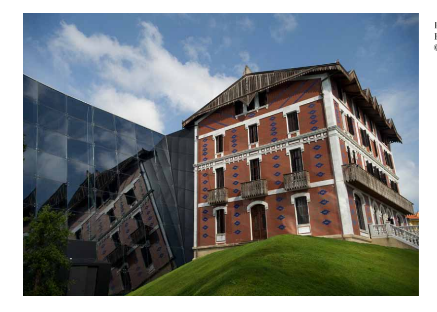
Exterior view of the Cristóbal Balenciaga Museum in Getaria.

The Cristóbal Balenciaga Museum, opened on 7 June 2011, is located in the town where the couturier was born, in commemoration of those early years of his professional training and maturing in order to understand his contributions to the world of fashion.